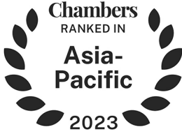
Bharucha & Partners