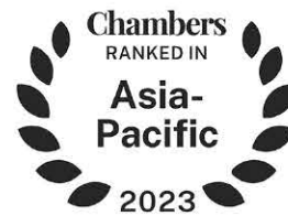
Bharucha & Partners